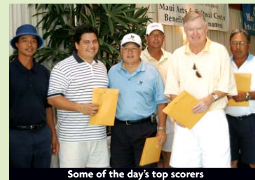
Some of the day's top scorers