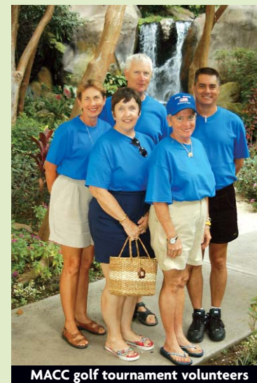
MACC golf tournament volunteers