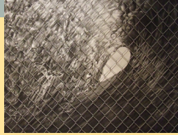
Access Denied charcoal on paper

My family's ancestral land was at this very location and many of their iwi is buried in the sand dunes. Now, multi-million-dollar homes are being built there, and access to the beach is virtually nonexistent. Will only the rich have access to Hawai'i's beaches in the future? My hope is that by holding up a mirror to what is occurring in Hawai'i, a dialogue will be generated that helps us to arrive at positive solutions.