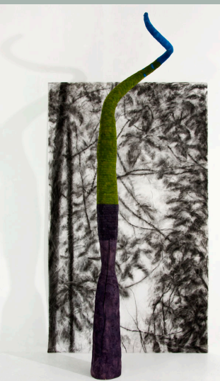
Ka maile lau li'i o Ko'iahi The fine-leaved maile of Ko'iahi charcoal on paper & sculpture

Some of the titles of my work are inspired by 'Olelo No'eau, a book written by Mary Kawena Pukui - an internationally recognized authority on Hawaiian life, literature and language. I use the 'olelo as titles sometimes, because they help convey the feelings I receive from the finished work. It also helps to cultivate a deeper level of appreciation for the viewer.