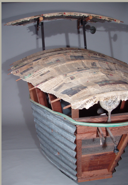
"Adrift On A Chinatown Junk" installation

In the "Out of State of Mind" body of work, investigations of issues from homelessness and litter, to resource depletion and global warming are explored with wit — and an unexpected cast of materials.